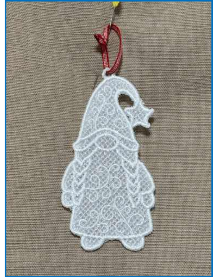
4X4 STITCHED BY FLO

A big thank you Dawn for testing this design.