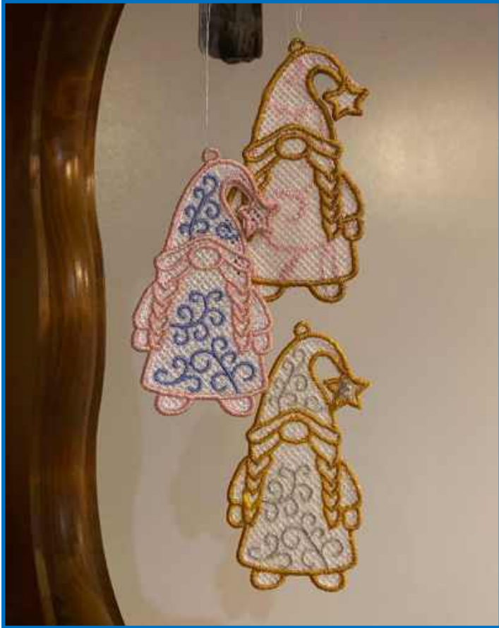
4X4 STITCHED BY DAWN

A big thank you Dawn for testing this design.